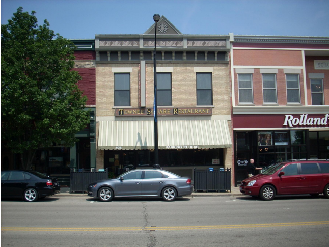
Photo Id: 508N Milwaukee Ave N508 (1950s)